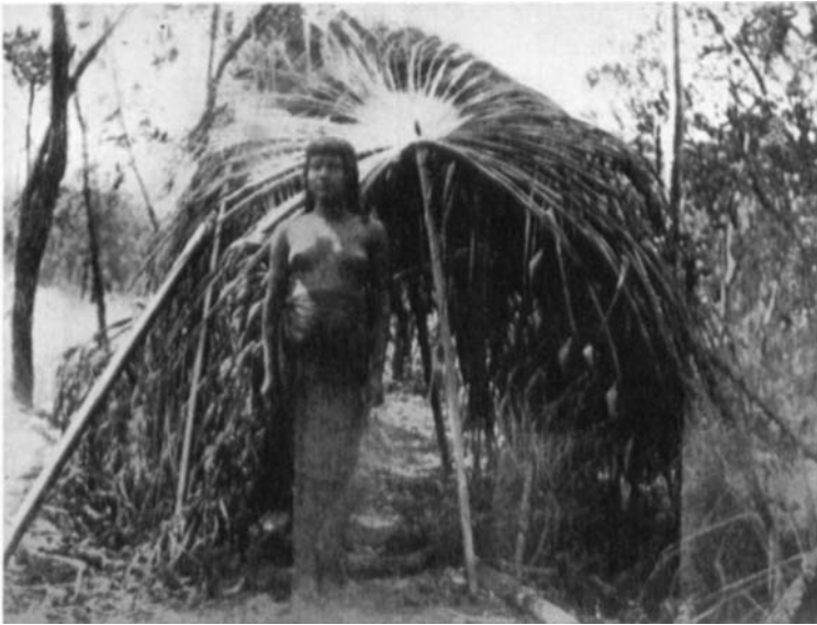
FIG. 3. Temporary round hut of the Ramko'kamekra.

Although the terms for husband's brother and for brother's wife (m. sp.) are not recorded, the vocabulary for affinities is evidently ample. The discrimination between wife and wife's sister is consistent with the absence of the sororate.