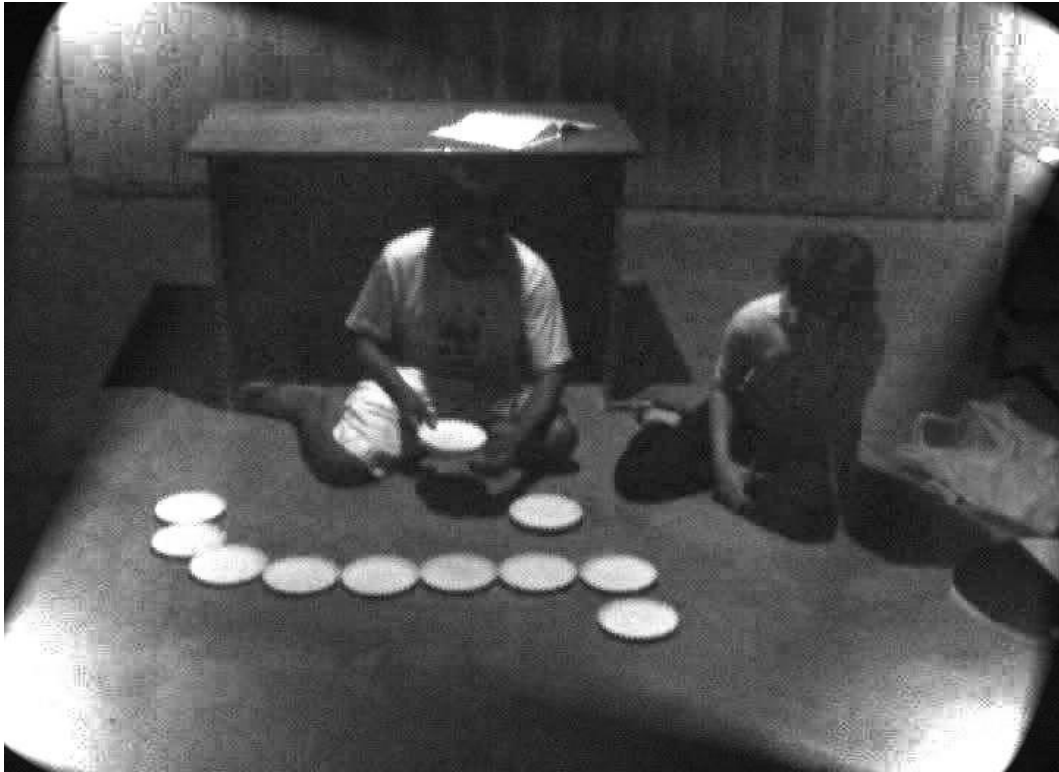
Figure 1: One participant's representation of the Amondawa year.

6.3.2. Results. In Amondawa, there is no word for 'year'. Linguistically, time is divided not into years, but into two seasons: the dry season Kuaripe 'in the sun' and the rainy season Amana 'rain'. The term Kuaripe , referring to the hot, dry season, derives from the noun Kuara 'sun', with the locative postposition pe , 'in' or 'at' (see Section 8 below). The rainy season is designated simply by the noun Amana which means rain. The passage of the seasons is marked by changes in the weather, and consequent changes in the landscape, and also by the rhythm of agricultural activities. Each season is further subdivided into three intervals corresponding to the beginning,