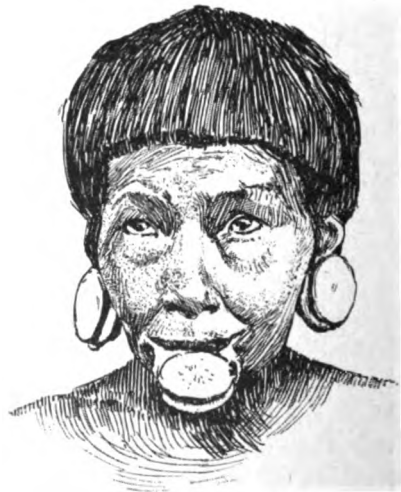
FIG. 2.—BOTOCUDU WOMAN, with both lip and ear ornaments of average size.