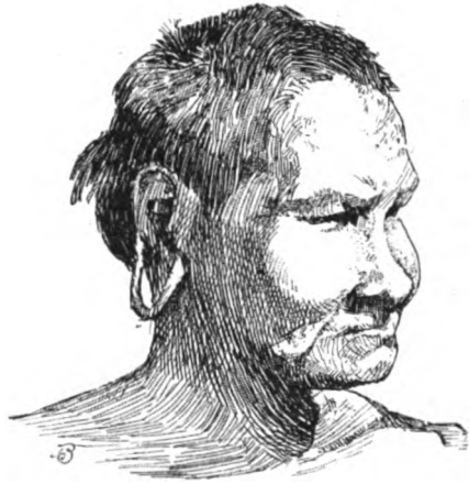
FIG. 3.—BOROCUDU MAN. The ear ornament has been removed and the distended lobe is allowed to hang free.

There is a fair collection of Brazilian Indian lip and ear orna-