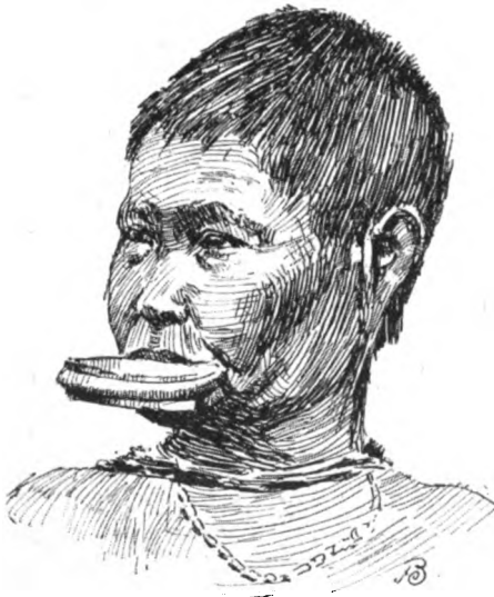
FIG. 4.—BOTOCUDU WOMAN. The ear ornament has been lost and the distended lobe is looped above the ear.

The stopper-shaped lip ornaments are now made of some light kind of wood. They are usually about three quarters of an inch thick and two inches in diameter, though sometimes they are much larger. Prince Maximilian measured one four inches across. Around the outside of the plug a little groove is cut, and when it is inserted the flesh band of the lip fits in this groove and thus holds the plug in place. With