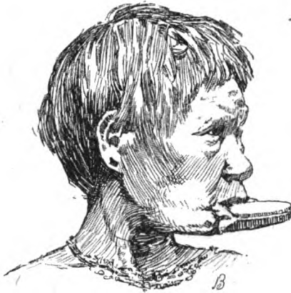
FIG. 1.—BOTOCUDU WOMAN. The flesh band of the lip has been broken and the ends tied together with a piece of bark, that the lip ornament may be used. An opening has been made in the ear lobe, but it is not of the customary size.

except with reference to their custom of wearing the large and broad lip and ear ornaments shown in the accompanying illustrations.