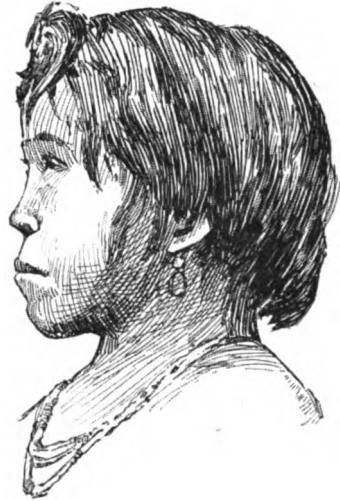
FIG. 5.—YOUNG BOTOCUDU WOMAN, AGE ABOUT SEVENTEEN. The ornaments worn in the ears are the modern pendants.

Many persons who have seen these pictures have thought such a fashion too inconvenient to last long. But the inconvenience of a fashion seems to have but little or nothing to do with either its origin or its perpetuity. Our own fashions are often complained of as tyrannical, unreasonable, unbecoming, inartistic, useless, whimsical, and everything else that is not downright wicked. But all people have fashions of one sort or another, and we can only congratulate ourselves that, however bad some of our fashions may be, they might have been worse than they are.