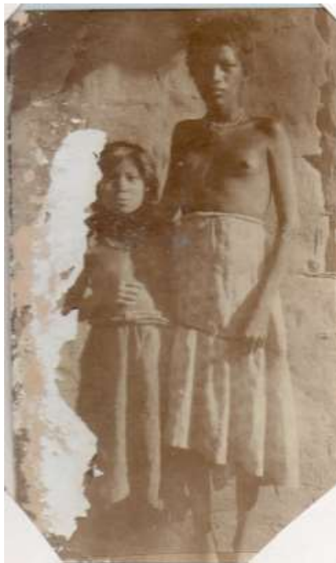
River Içana. Mapanaí people. Yandu hut