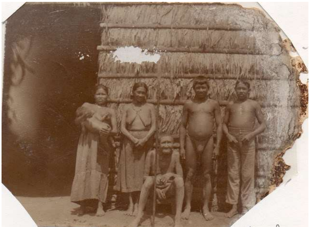
Walipere-dakenai Indians, the old Tuxaua (chief) and family